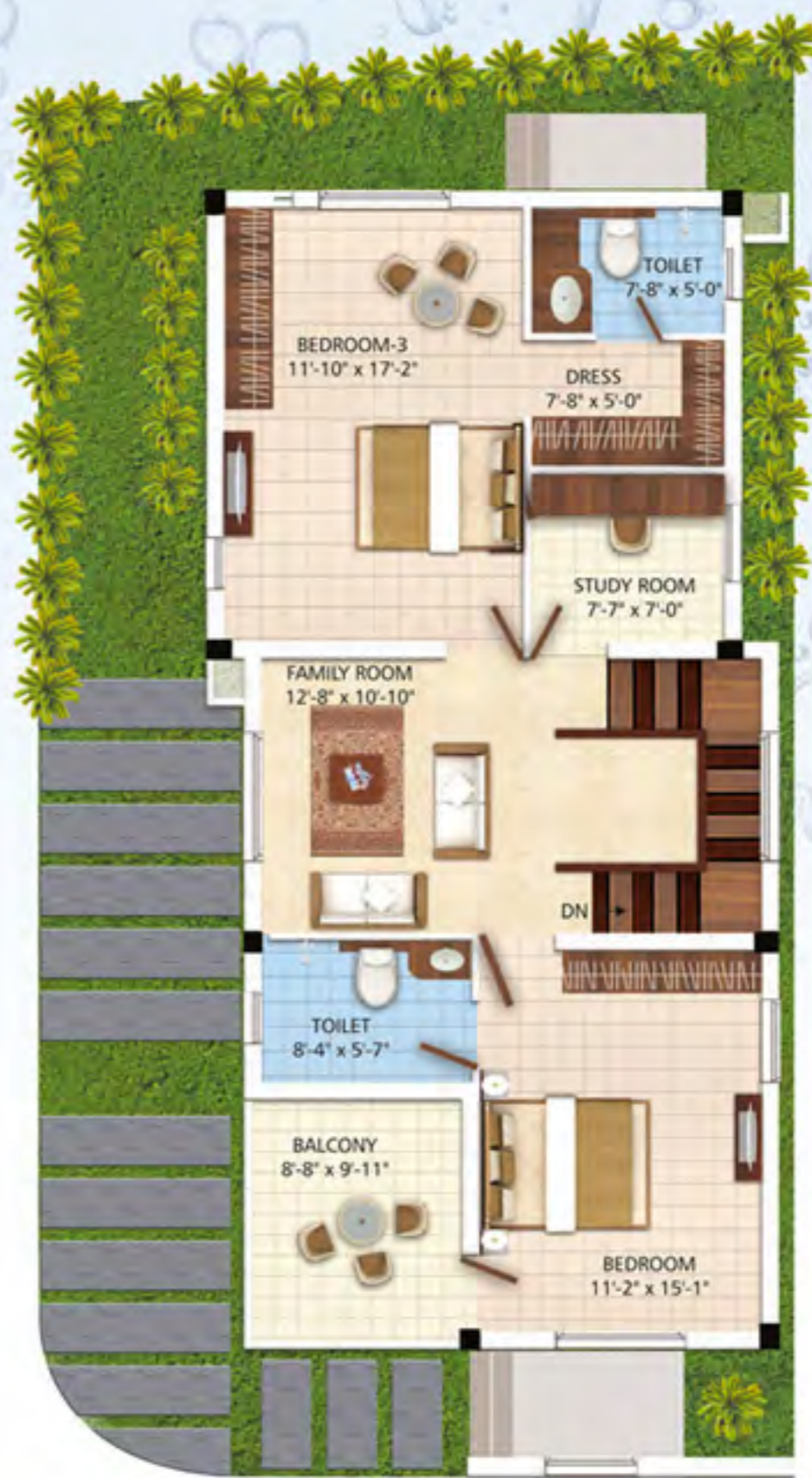
PLOT - 11 FIRST FLOOR