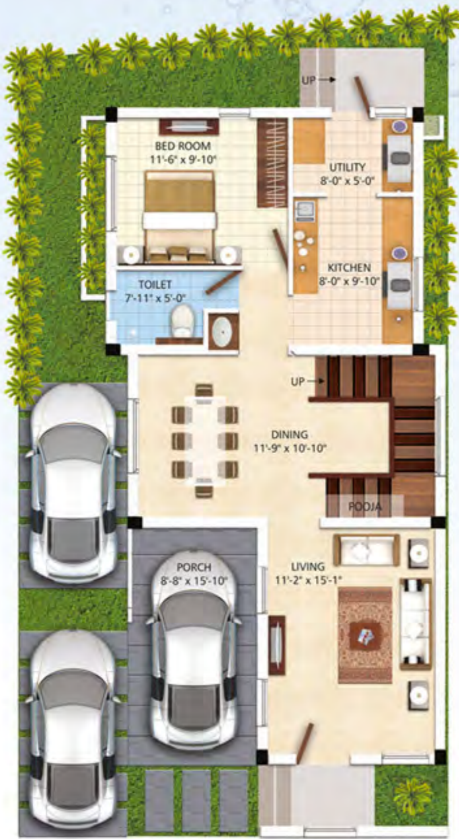
PLOT - 3 GROUND FLOOR