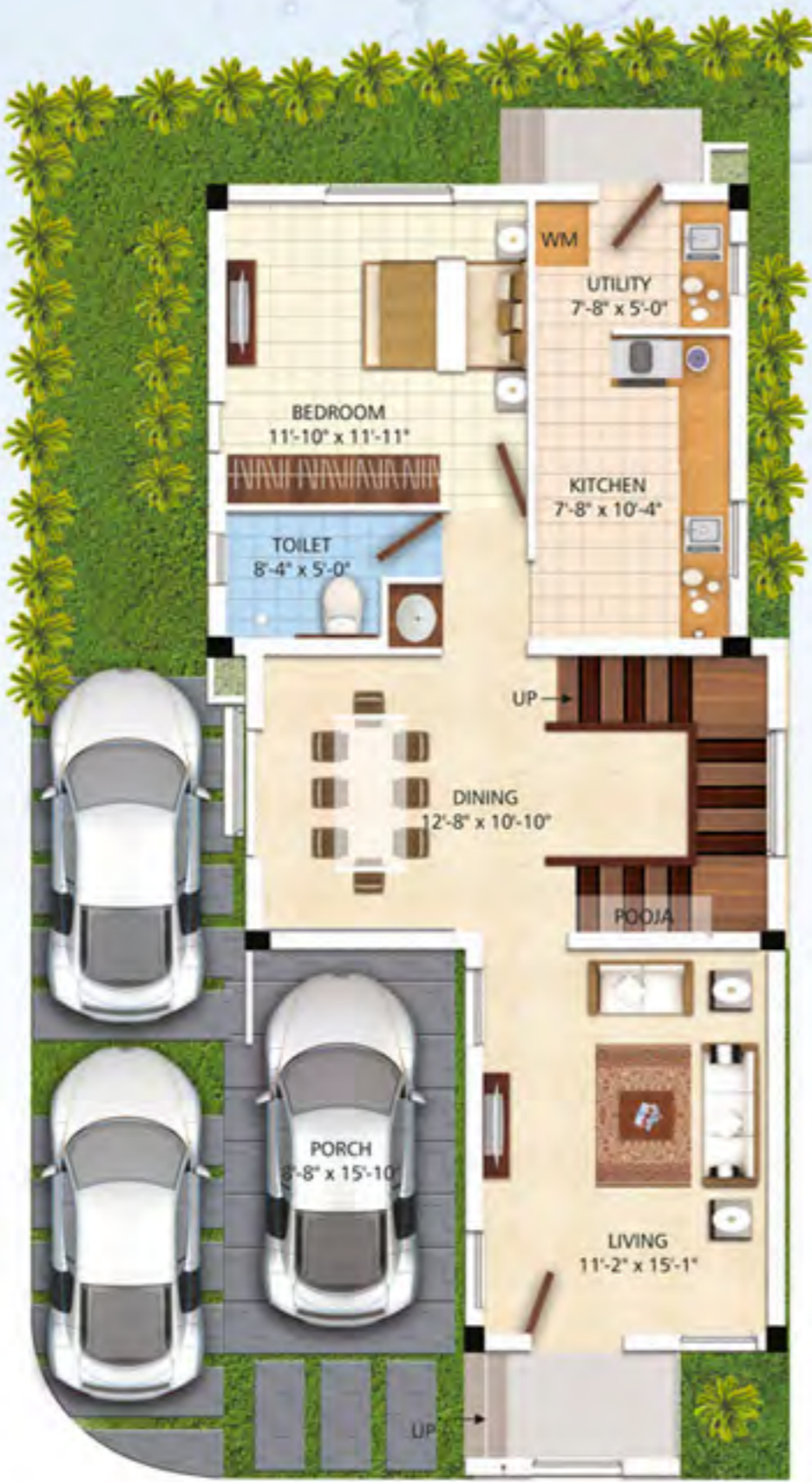
PLOT - 11 GROUND FLOOR