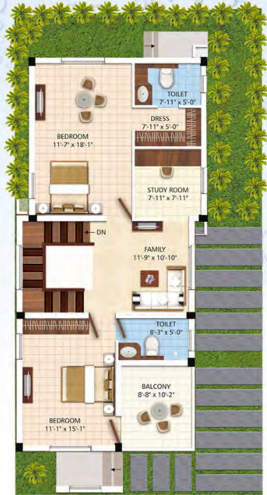
PLOT - 20 FIRST FLOOR