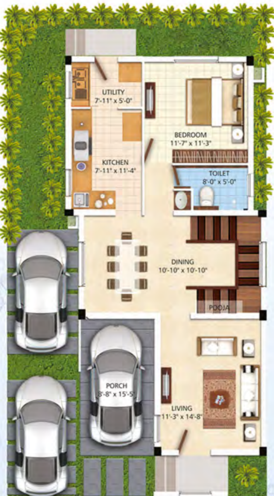
PLOT - 16 GROUND FLOOR