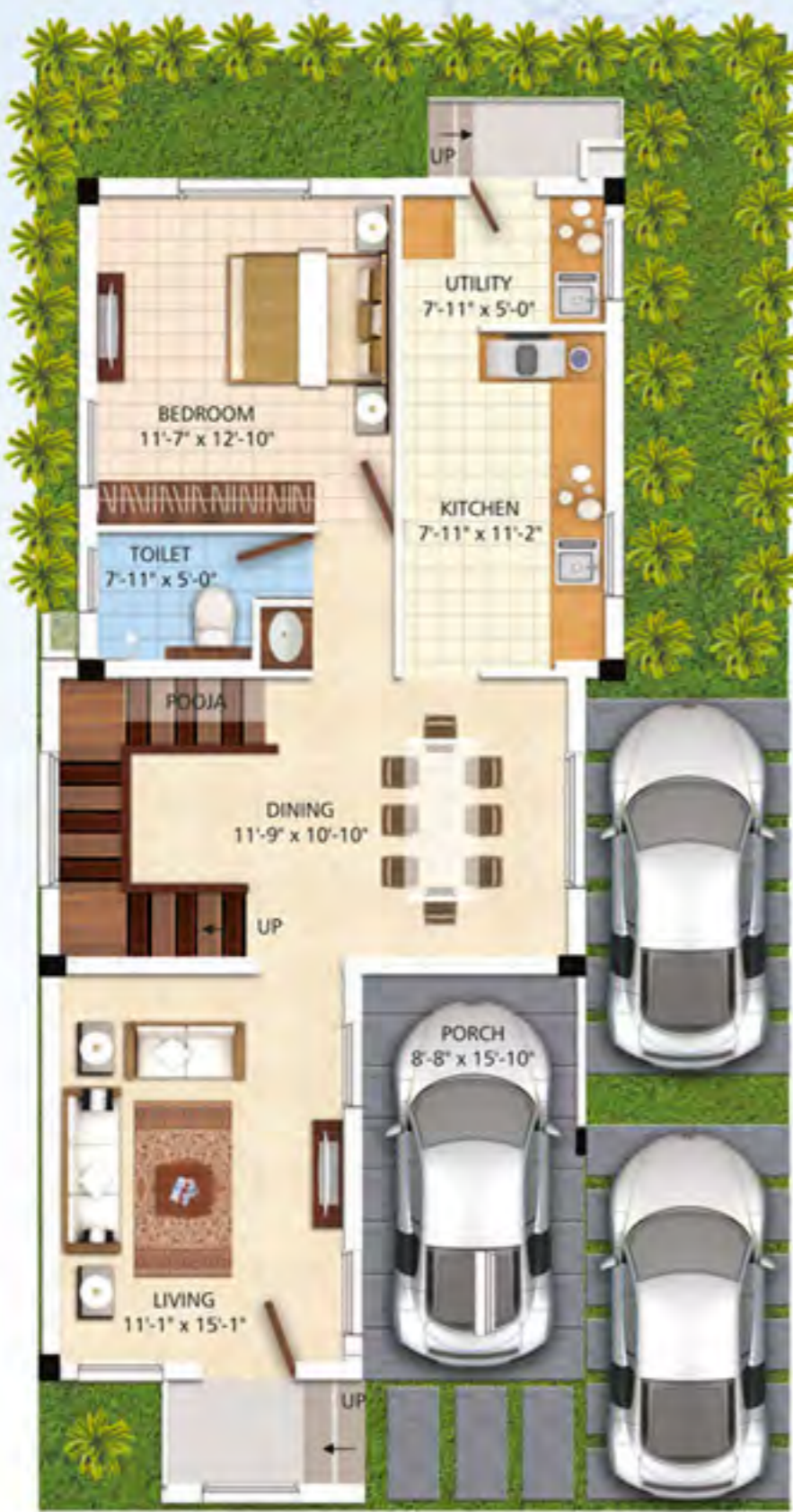
PLOT - 20 GROUND FLOOR