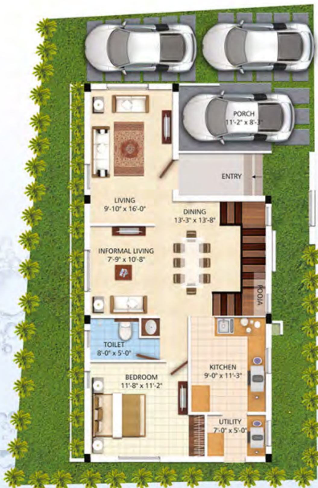
PLOT - 9 GROUND FLOOR