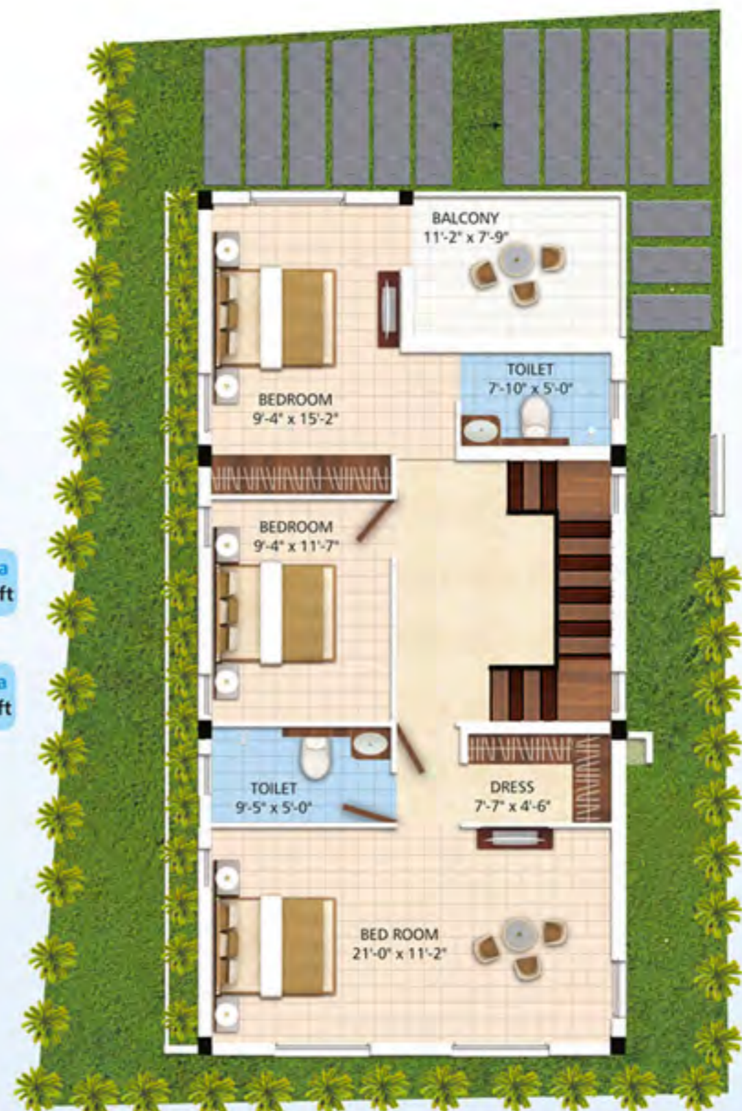
PLOT - 9 FIRST FLOOR