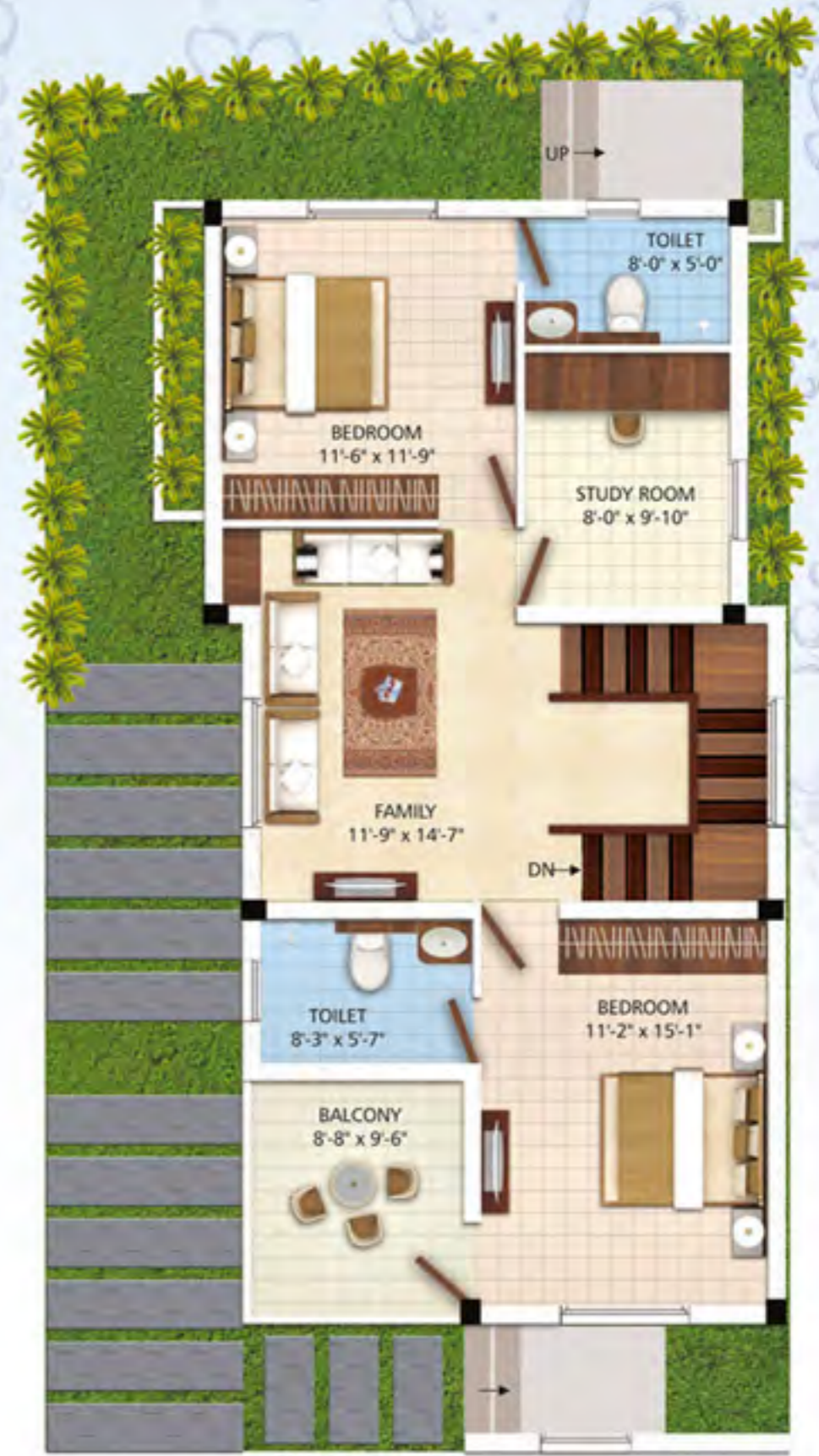
PLOT - 3 FIRST FLOOR