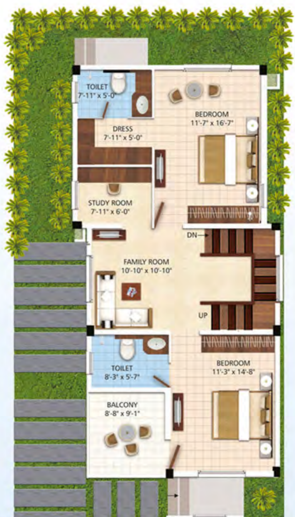
PLOT - 16 FIRST FLOOR