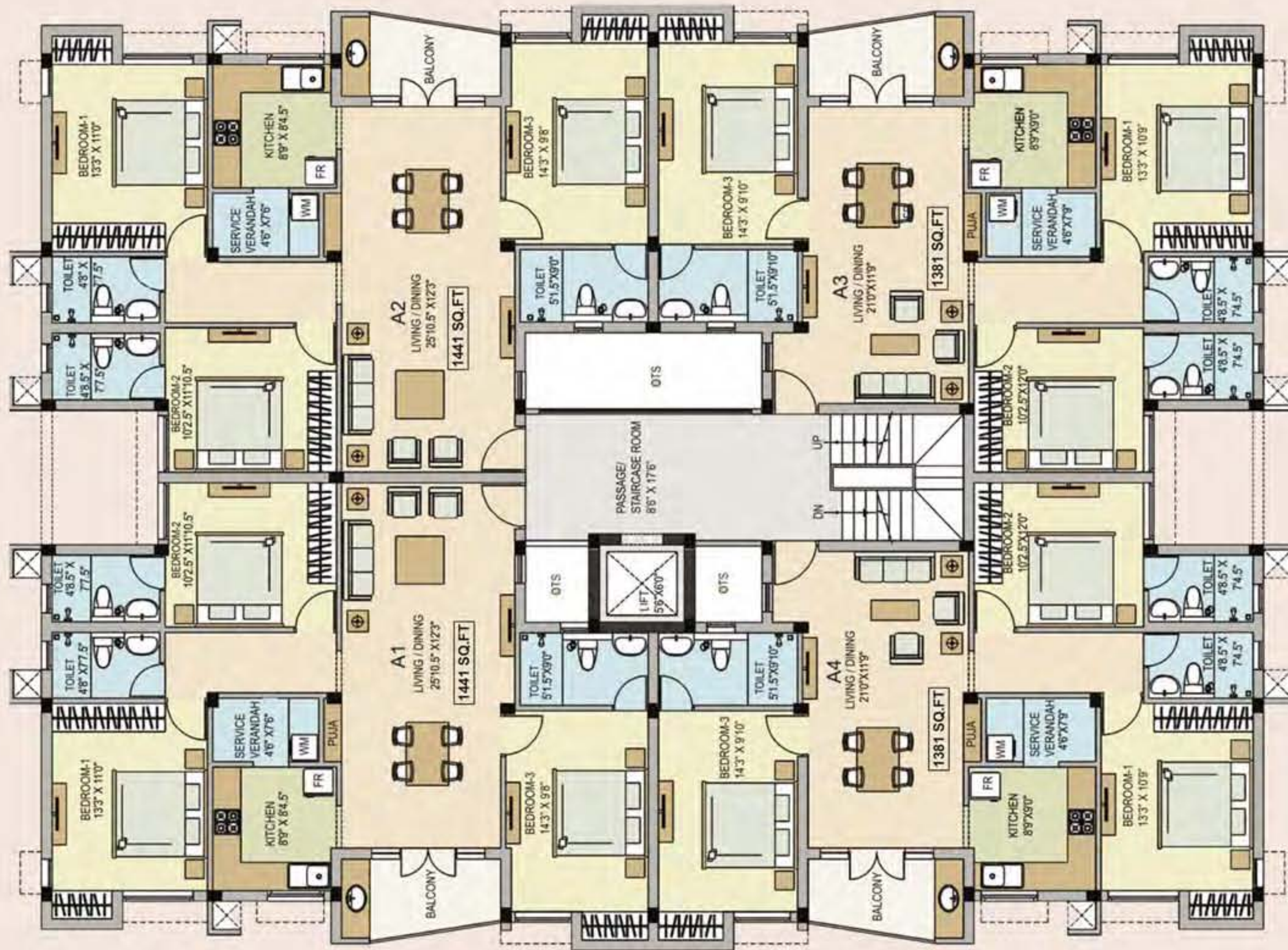
Block A Typical Floor Plan