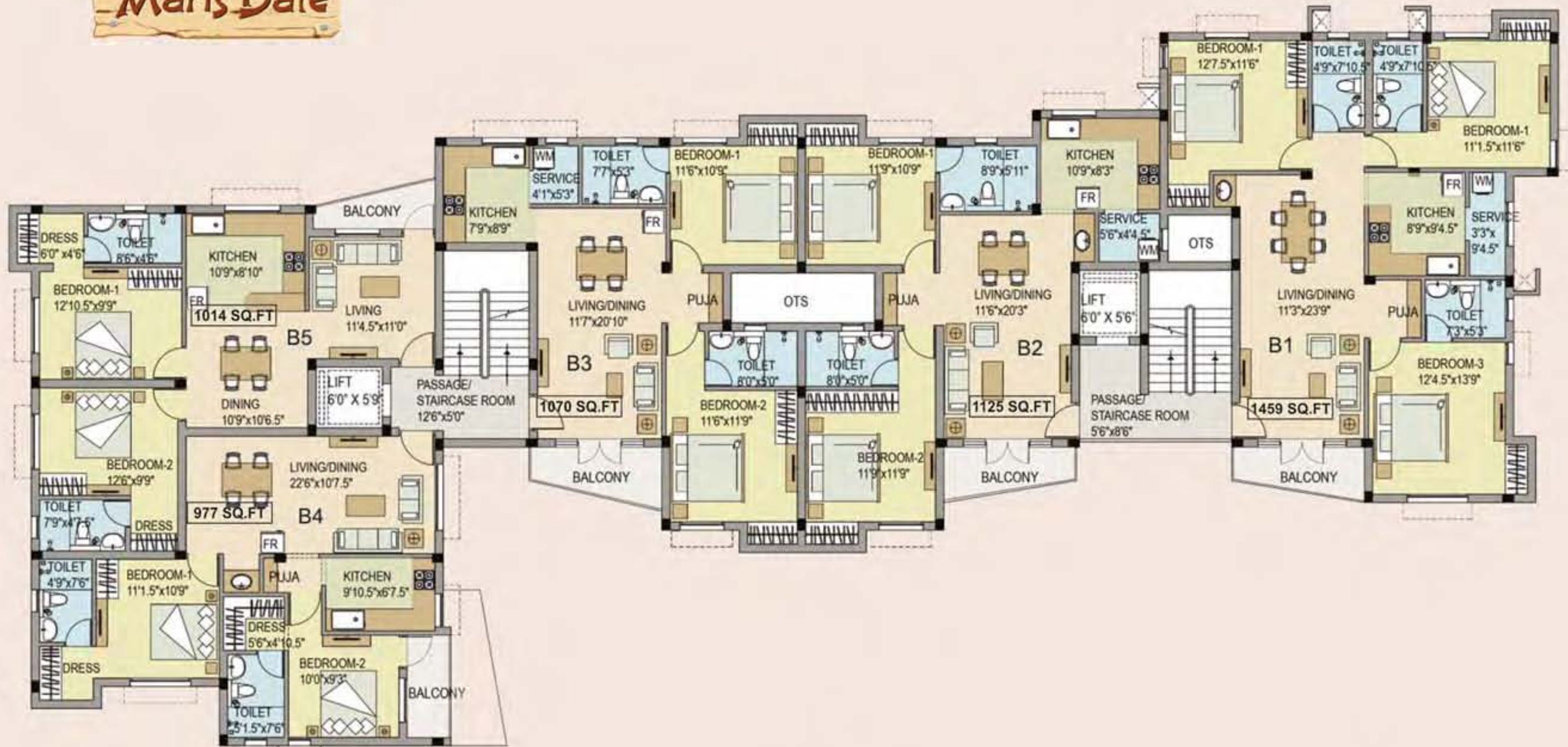
Block B First Floor Plan