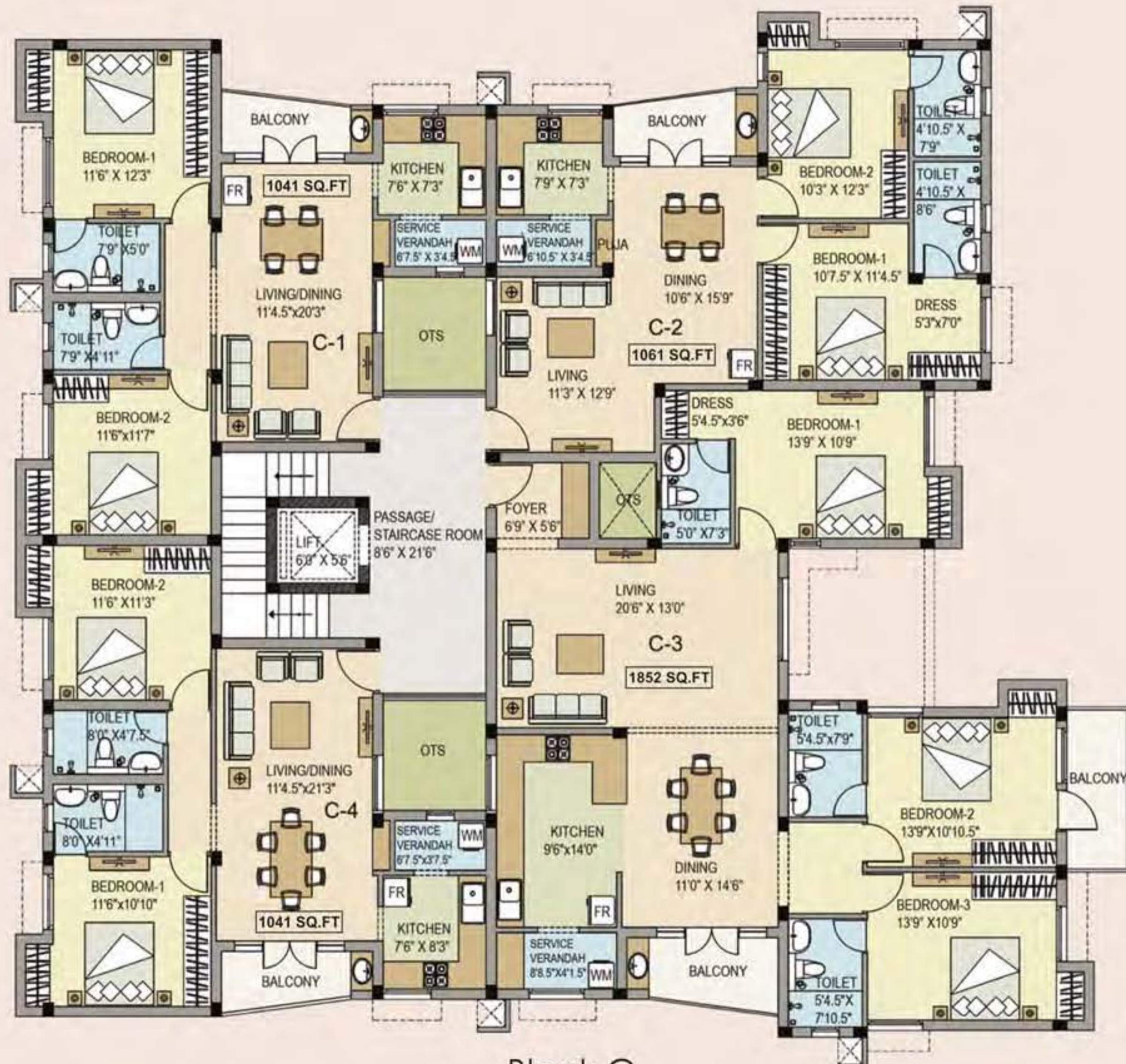
Block C Typical Floor Plan