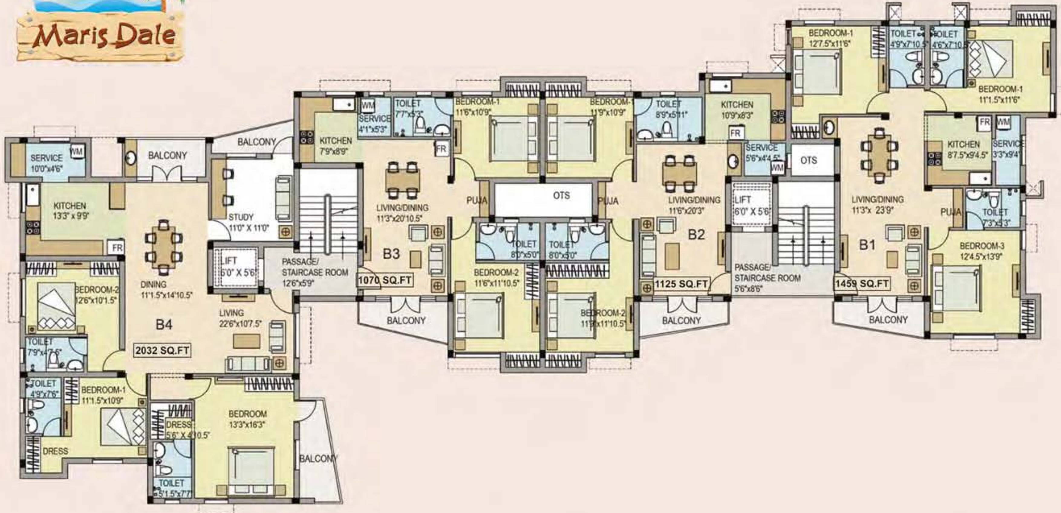
Block B Typical Floor Plan